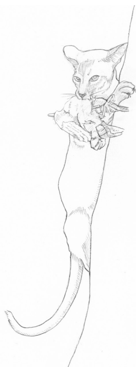
FIGURE 1. Artist's rendering drawn from local Malagasy descriptions and confirmed likeness of a fitoaty . © Joel Borgerson

The morphology of wild living cats in Madagascar has been described as "easily distinguishable from domestic cats" (Brockman et al. 2008: 137). Their pelage is similar to that of wild living cats elsewhere in the world (Goodman et al. 2003; for a description of typical pelage cf. Daniels et al. 1998) and is characterized by an underlying agouti/tawny brown coat with overlying dark grey tabby patterning, a dark banded tail, and lack of variation in coat pattern (Daniels et al. 1998, Goodman et al. 2003, Brockman et al. 2008). They have also been described as larger than domestic cats (both in overall weight, height, and length), and as exhibiting significant sexual dimorphism (males twice as large as females) (Goodman et al. 2003, Brockman et al. 2008). While most wild living cats around the world have tabby coats, some wildcat ( Felis silvestris ) populations in Scotland exhibit a variety of coat patterns including "primarily