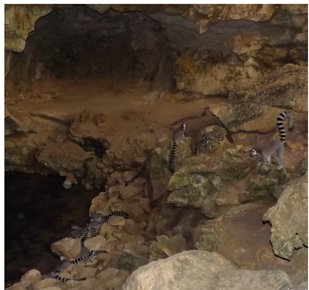
FIGURE 2. The ILove troop drinking water from the Grotte Mitoho at Tsimanampesotse.

Cave use by non-human primates has been linked to thermoregulation, predator avoidance, and/or resource access, as well as refugia in response to human actions such as deforestation (e.g., Pruetz 2001, 2007, Huang et al. 2003, McGrew et al. 2003, Goodman 2006, Workman 2010). Similar to the langurs of Southeast Asia discussed earlier (Huang et al. 2003, Workman 2010), ring-tailed lemur cave use in the Andringitra and Tsaranoro region much further north of Tsimanampesotse and Tsinjoriake is likely linked to deforestation, given only remnant forests exist in these areas (Goodman and Langrand 1996, Cameron and Gould 2013). As the areas in which observations of cliff-face and cave use display intact forests, at least until recently, it is unlikely that cave use in this region is a direct response to deforestation.