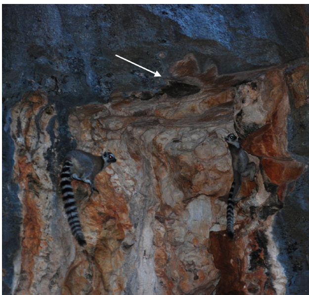
FIGURE 1. The ILove troop lemurs on cliff-face, about to enter small sleeping caves at Tsimanampesotse National Park. Arrow denotes one of the sleeping caves.

At Tsinjoriake, of the eight troops observed, four commonly used one of three caves for sleeping at night (Grotte Binabe: Troops 2 and 4; Grotte Binakely: Troop 3; Grotte Ambanilia: Ekipa Troop). During the 2013 visit to the area no direct observations of the lemurs using Grotte Ambanilia were made, but fresh L. catta fecal material near the entrance was found, indicating they were still using this cave as resting or sleeping sites.