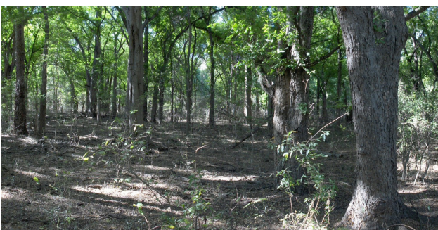
FIGURE 2. Disturbed habitat at Beza Mahafaly Special Reserve in the area where the remains of ring-tailed lemur ( Lemur catta ) female #271 were found. Note the lack of understory and large trees to escape potential predators.

The cause of this adult female's death is equivocal, although the bony evidence is consistent with dog predation or scavenging. Since 2003, several of the authors and the local BMSR ecological monitoring team have observed serious attacks and