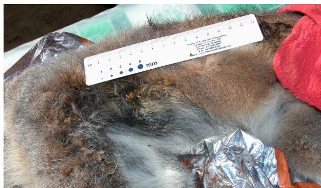
FIGURE 1. Intestinal contents extruding from a 3 mm diameter hole in the lower middle aspect of the right flank of wild ring-tailed lemur ( Lemur catta ) female #271. The female is laying on the table with the head to the right.

Upon physical examination, the lemur weighed 2.12 kg, a normal increase in body mass over the 1.42 kg she weighed when first captured as a sub-adult on 29 July 2006. She was considered to be in ideal body condition, but had patchy hair loss on the lateral aspect of the right thigh and flank; the remaining hair in these regions was matted and contaminated with faecal material. During palpation, a small amount of wet, pasty faecal material extruded from a 3 mm diameter fistula in the lower middle aspect of the right flank (Figure 1). The material had the texture and colour of normal faeces, but was not well formed, suggesting it was from the coecum or proximal colon. The skin around the hole was pink and showed no erythema, thickening, or pus, indicating that the skin was healthy and that the injury was not actively inflamed, but rather chronic in nature; an exact timeline could not, however, be determined. Several well-formed, soft faecal pellets were voided rectally during the examination, indicating that the injury was not interfering with