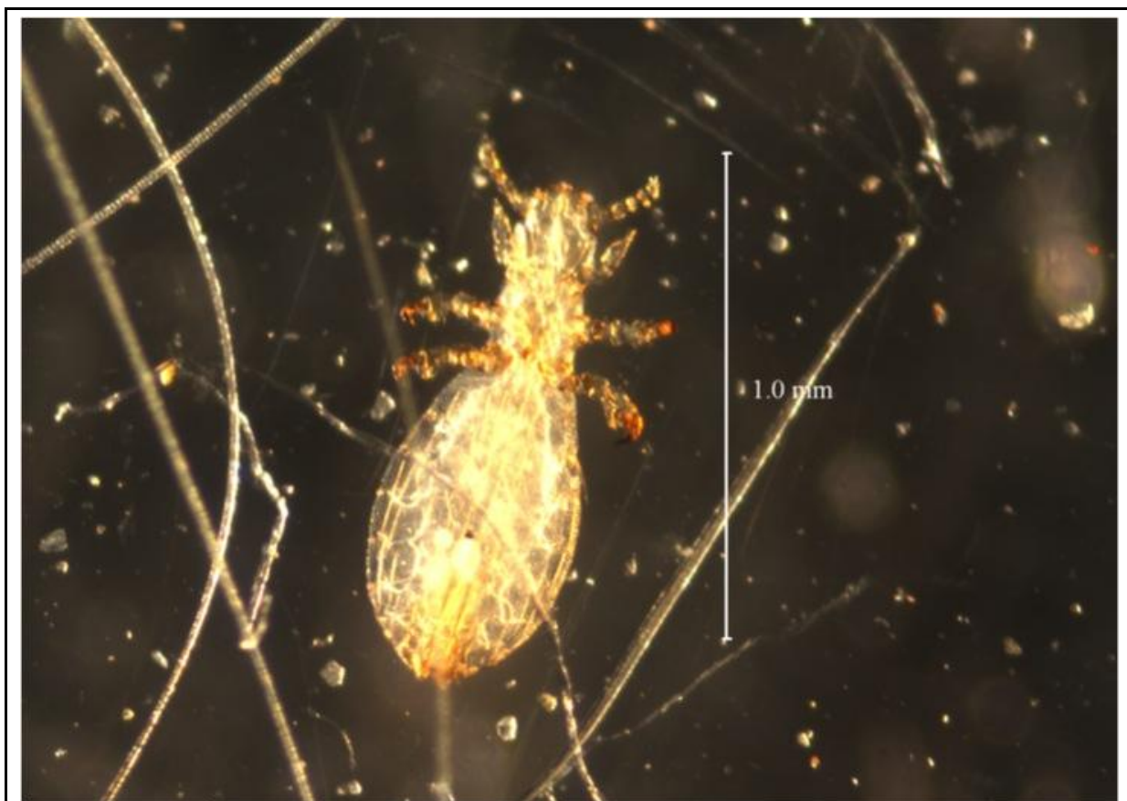
FIGURE S4. Ventral view of louse ( Lemurpediculus cf. verruculosus ) collected from Microcebus griseorufus at BMSR.