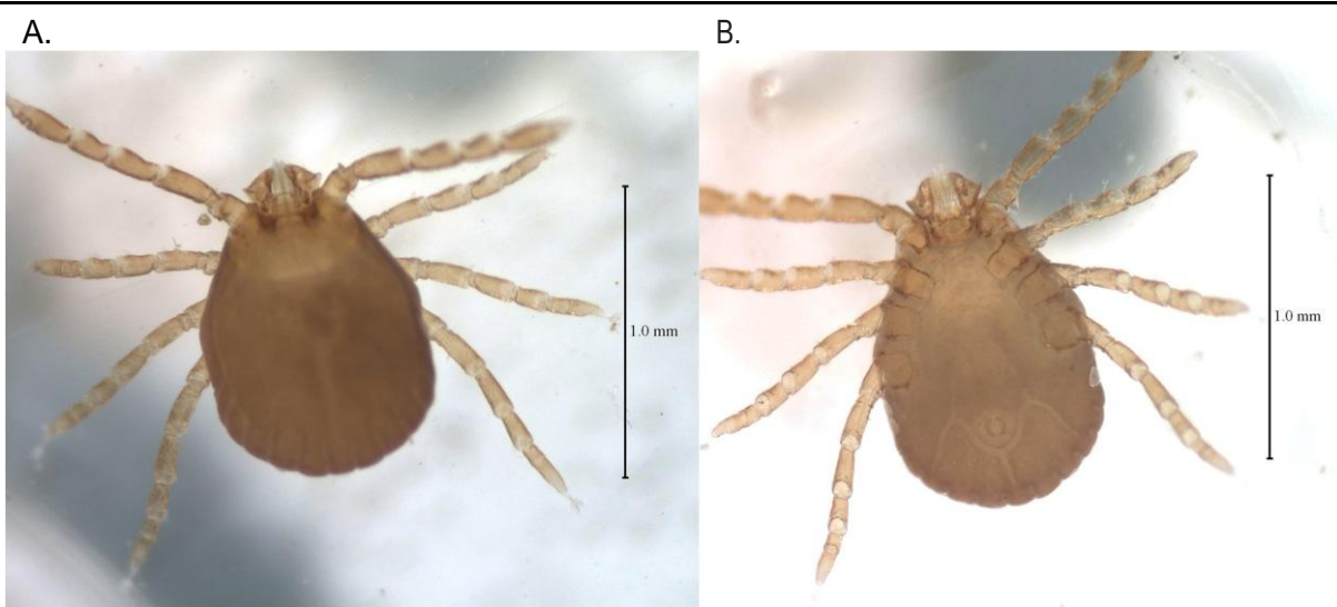
FIGURE S2. A. Dorsal view of Haemaphysalis lemuris . B. Ventral view of H. lemuris .