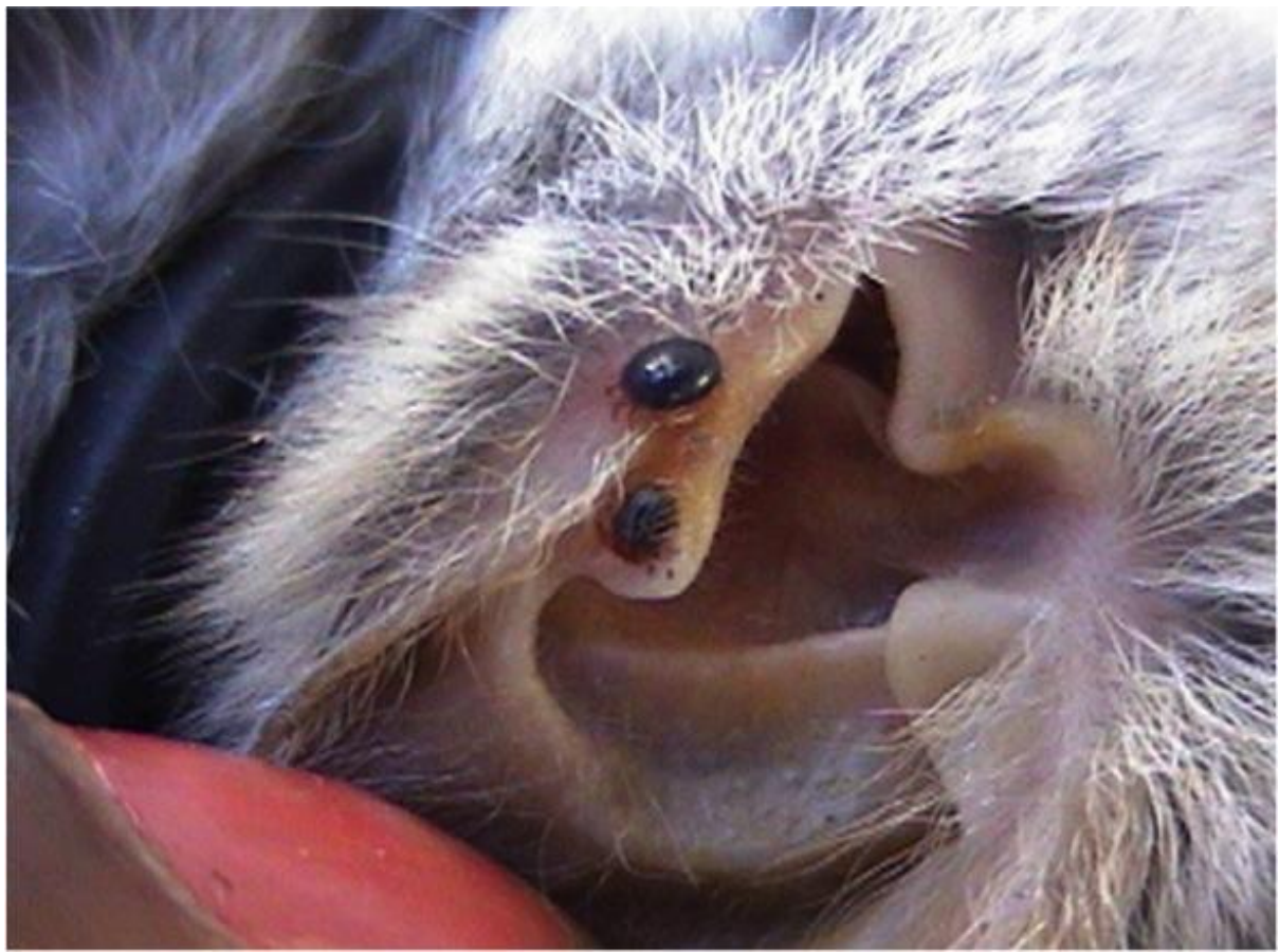
FIGURE S1. Ticks found on the ears of Microcebus at BMSR.