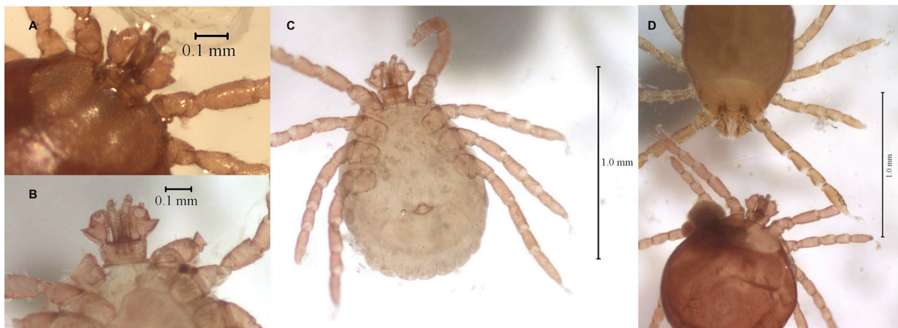
FIGURE 2. A. Dorsal view of the mouthparts of the second haemaphysaline in our sample ( Haemaphysalis cf. simplex ). B. Ventral view of the mouthparts. C. Ventral view of the body. D. Dorsal view of both haemaphysaline species infesting mouse lemurs at BMSR. H. lemuris is pictured at the top.