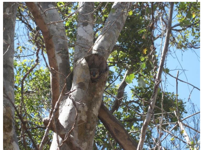
Figure S1. Illustration of Strychnos madagascariensis tree hole hosting a Daraina sportive lemur. This picture shows a L. milanoii resting in a S. madagascariensis tree hole. (left) Benanofy forest, hole with 2 entries at 3.8 m height and a depth of 1.1 m, credit T. N. Ralantoharijoana. (right) Solaniampilana forest, hole with 1 entries at 3.7 m height and a depth of 0.74 m, credit T. N. Ralantoharijoana.