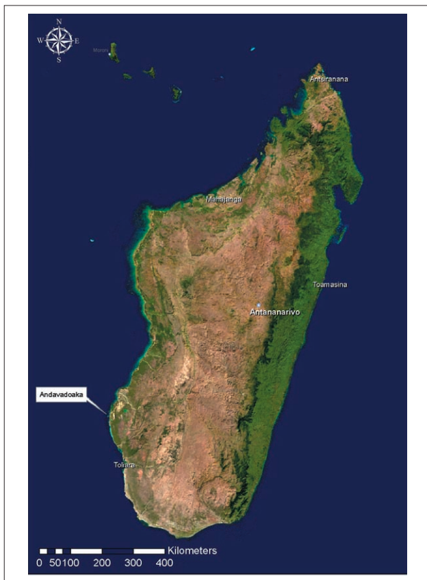
FIGURE 1. Location of the Andavadoaka region, southwest Madagascar.

2000). Limited employment opportunities, combined with low agricultural productivity, resulted in a five-fold increase in the fishing population in a period of 17 years leading up to the early 1990ties, causing an overexploitation of marine resources, especially near urban centres such as Toliara (Gabri  et al. 2000). Laroche et al. (1997) provide evidence that over-fishing in the Toliara region has led fishers to target lower value fish in an effort to sustain yields in the face of reduced stocks of large piscivorous species. At the beginning of the new century, over 50% of the artisanal fishing in Madagascar was estimated to occur along the reef systems of the southwest (Cooke et al. 2000). The village of Andavadoaka, at the geographical centre of this project area, has seen a doubling of population input rate (births and immigration arrivals per year) in the 10 years leading up to 2003, with over 50% of the population being aged 14 or under. Fishing is the primary economic activity for 71% of villagers (Langley et al. 2006).