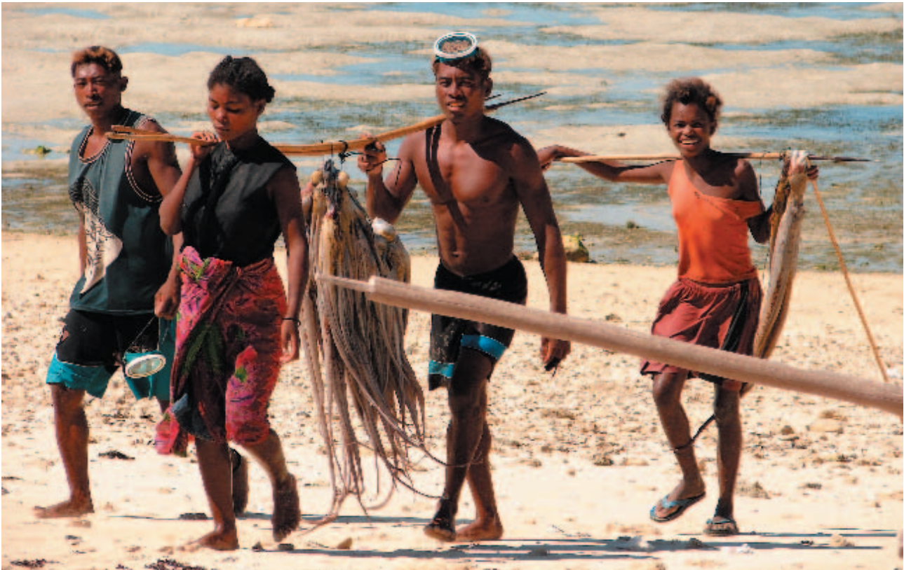
FIGURE 4. Fishers landing catch of Octopus cyanea following reopening of Nosy Fasy no take zone, 2006.

only extractive options for resource utilisation. With a growing market of tourists arriving in Andavadoaka the potential exists to incorporate local villagers into this expanding service industry and for local communities to obtain substantial economic gain in doing so. By demonstrating to local villages that coral reef and other marine and terrestrial resources can be used to generate income from non-extractive activities, whilst also simultaneously achieving conservation and fishery benefits, protected areas have the potential to provide a greater appreciation for, and understanding of, natural resources within the region. The need to develop Velondriake's capacity to receive, host and guide ecotourists has led to the development of a community eco-guide training programme, and plans for construction of a community-run eco-lodge, which will be fully owned and managed by the village of Andavadoaka, and occupied in part by visitors brought to the region by Blue Ventures' existing ecotourism programmes, which currently account for over 7,000 tourist-nights to the village each year.