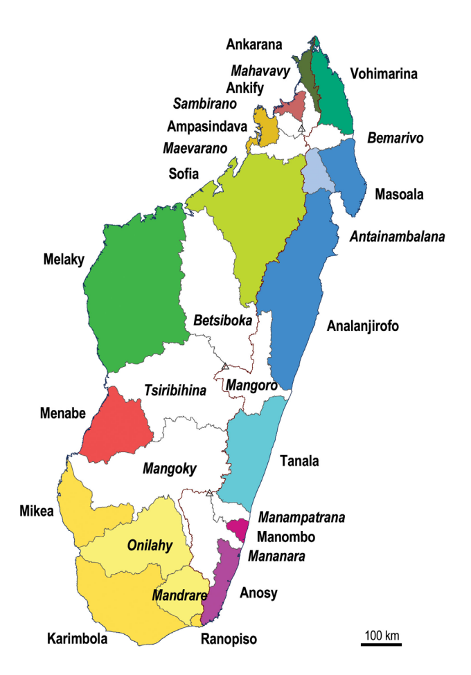
FIGURE 1. Retreat-dispersion watersheds (white – italic) and centers of endemism (colored – regular).

People need to give names to sites or areas to be able to communicate, identify and locate them in space (Kadmon 2000). Geographical names or labels often have a meaning inspired by a location's topography, prominent landscape feature(s), hydrography, or characteristic fauna and flora. A toponym usually reduces the multidimensional complexity of a locale and abstracts the dimensions to one name representing the fundamental traits of it (Conedera et al. 2007). Table 1 lists the already existing toponymy of rivers as mentioned on the topographical