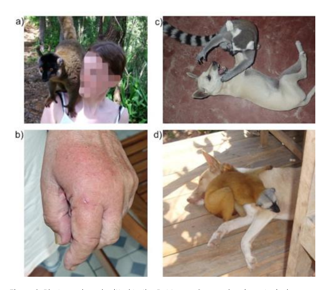
Figure 2. Photographs submitted to the Pet Lemur Survey showing a typical human-lemur encounter by a tourist (a), a scar on the hand of a pet lemur owner in Madagascar from a lemur bite (b), and two different habituated pet lemurs (owned by two different owners) interacting with domestic dogs (c,d).

individuals (63% in 1902, 58% in 1910, 77% in 1960, and between 90% - 97% from 2006 to 2015; Sources B, C, E, G-O, respectively in Table S1) received their PEP treatment in the greater Antananarivo area.