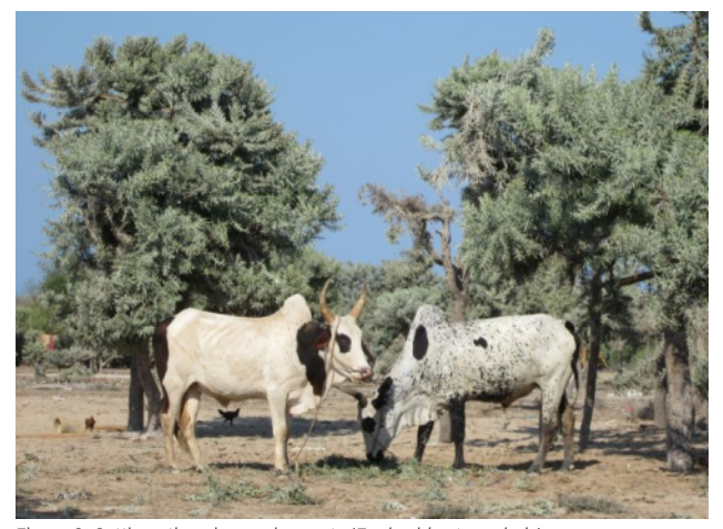
Figure 2: Cattle eating chopped samata (Euphorbia stenoclada).

The social and political organization of the Tanalana and Mahafaly people is based both on the traditional ethnic structure of common ancestors ( raza ) with clans and subordinated lineages,